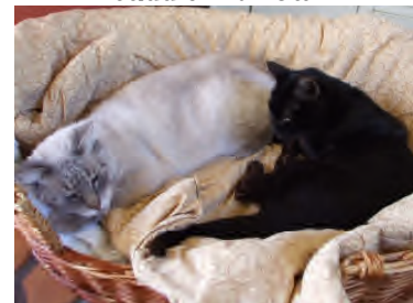
Curled up with Oliver